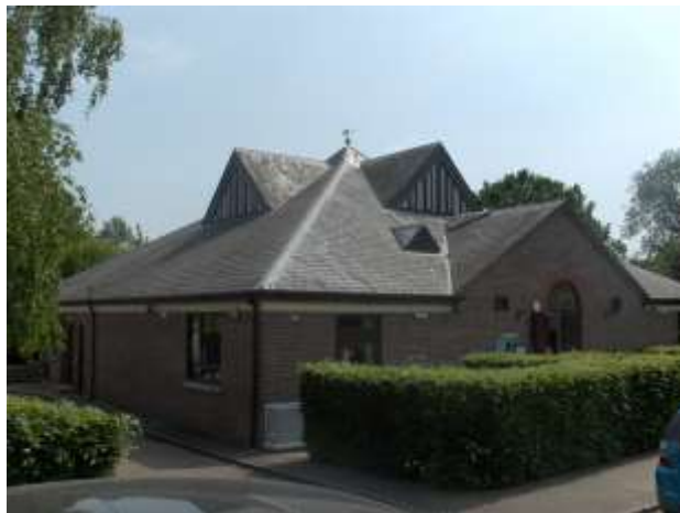
North Heath Hall, North Heath Lane.

On July 6 th North Horsham Parish Council is asking people to take a photograph of North Horsham as a record of what our parish is like in 2019. Photographs that are submitted will be published on the Parish Council website. Look out for the Horsham Now and Then event which will be held on a Saturday morning in September. The Parish Council will be inviting residents to bring along old photographs of the parish and there will be an opportunity to reminisce and to bring the history of the parish alive.