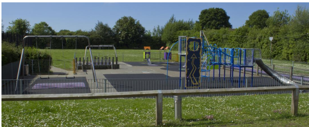
Play area at Holbrook Tythe Barn

The playgrounds continue to be popular and there is an ongoing schedule of maintenance and inspection. The 30 Parish Council owned allotments are all occupied and there are 2 people on the waiting list. The allotments are inspected regularly.